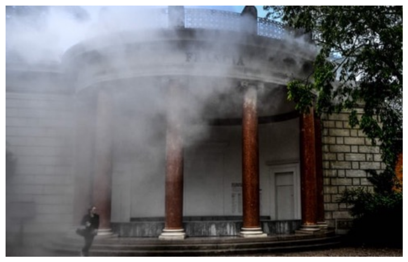
A visitor leaves Laure Prouvost's French pavilion, Venice 2019.