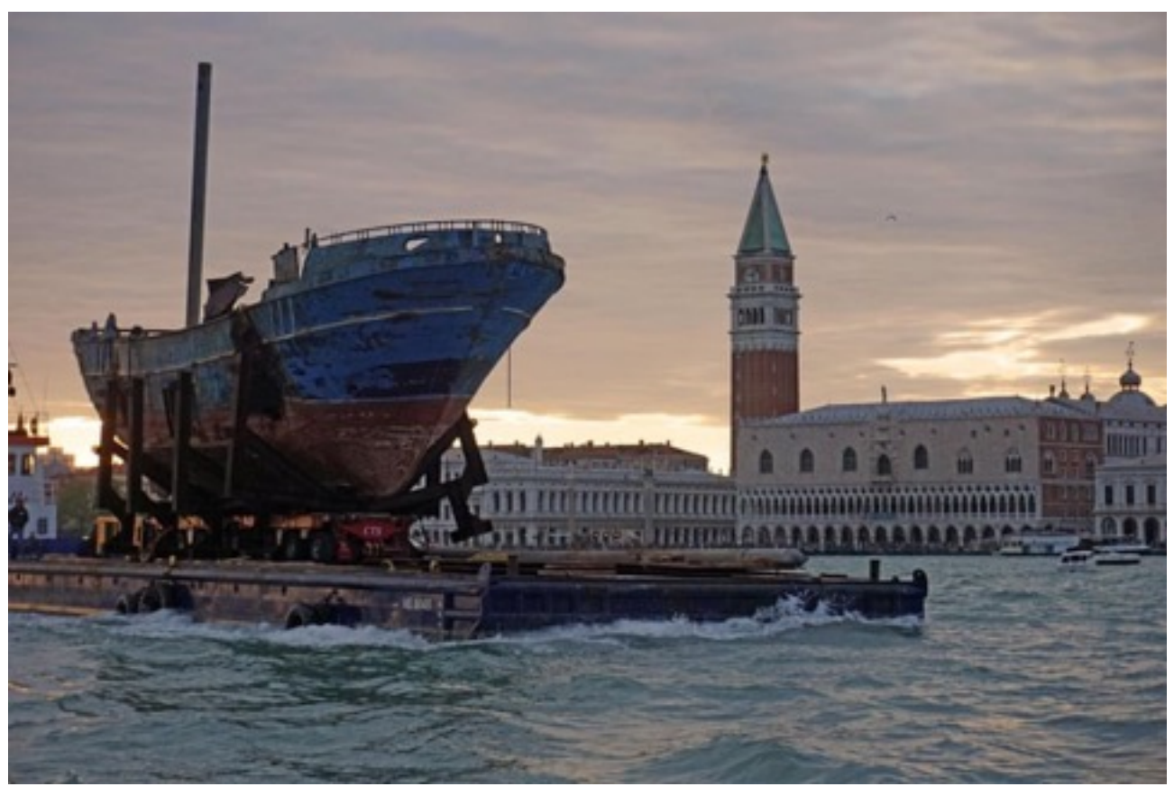
'Appalling conjunction': the arrival in Venice of Swiss artist Christoph Büchel's Barca Nostra, his artwork using the fishing boat that sank off Lampedusa in 2015 with more than 800 migrants onboard.

Kazakhstan were both cancelled by their own governments at the last minute. Geopolitics is always in play here. If there was a prize for the worst pavilion – and the competition is not small – it would surely go to Austria's garden of scarlet vagina-blossoms with shiny steel stamens. This is just crass. Far more disturbing – just as he likes it – is Christoph Büchel's "intervention" in the Arsenale. The Swiss artist has worked with Venetian authorities to install the rusted wreck of the fishing boat that sank near the Italian island of Lampedusa in 2015, with the loss of more than 800 migrants, many of them trapped in the hold.