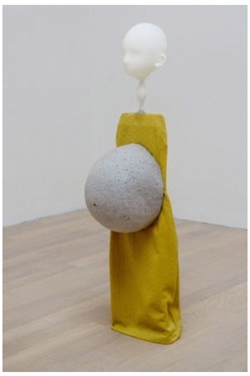
Part of Cathy Wilkes's show for the British pavilion.

One at a time is probably the best way to see Cathy Wilkes's melancholy show, in any case. Any more might overwhelm her tiny figures, with their white discs for heads and their distended grey bellies, children of poverty and hunger. A mother of sorts is evoked in the stark white arms that rise out of a basin, as if petrified in the constant act of washing up, and in the headless figure in a green 30s dress that stands upon feet of clay. Behind her lies another foot, perhaps the ghost of a lost child. There are faint red stains on the floor and a nameless bundle of rags. Some sort of narrative is building.